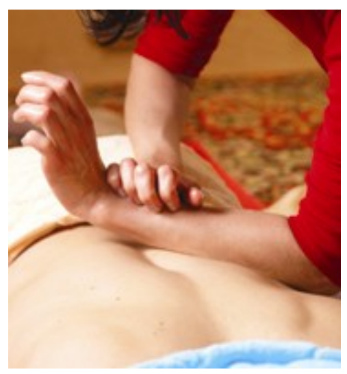
Therapeutic massage actually feels good.

great experience in the session and feel better afterward.